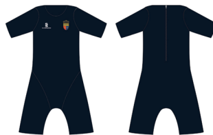
Modesty Swimsuit Primary & Secondary