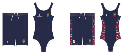
Swim Jammers & Swimsuit Primary