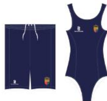
Swim Jammers & Swimsuit Primary