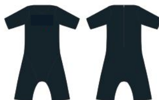
Modesty Swimsuit Primary & Secondary